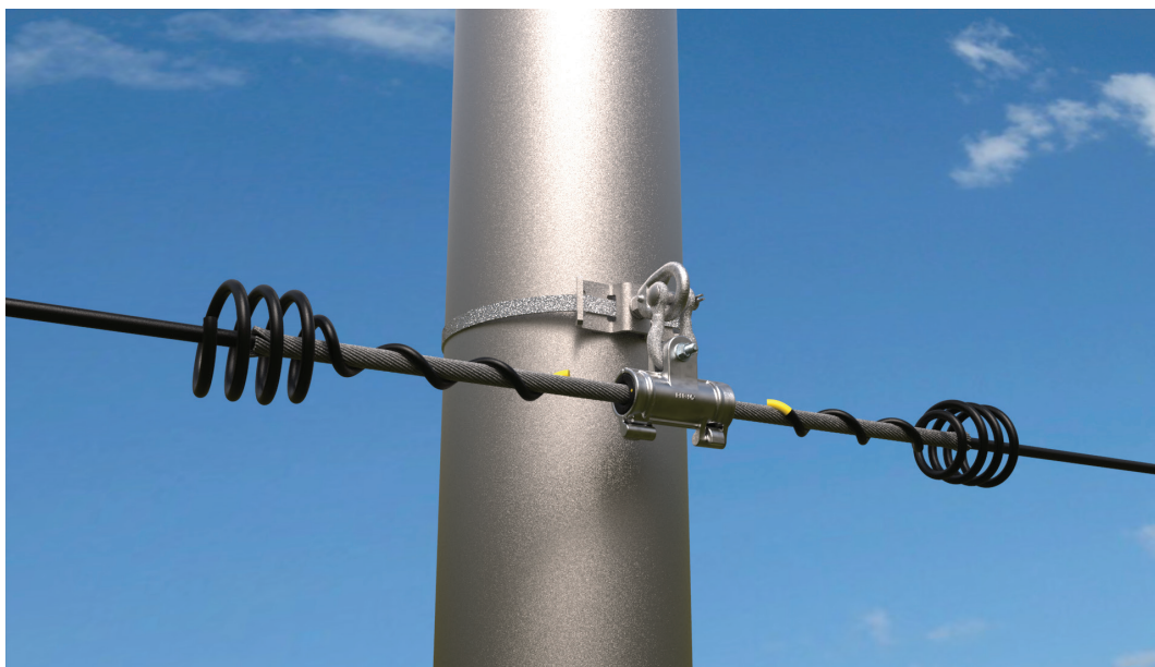
FIBERLIGN® ADSS-CORONA™ Coil Applied on SRR