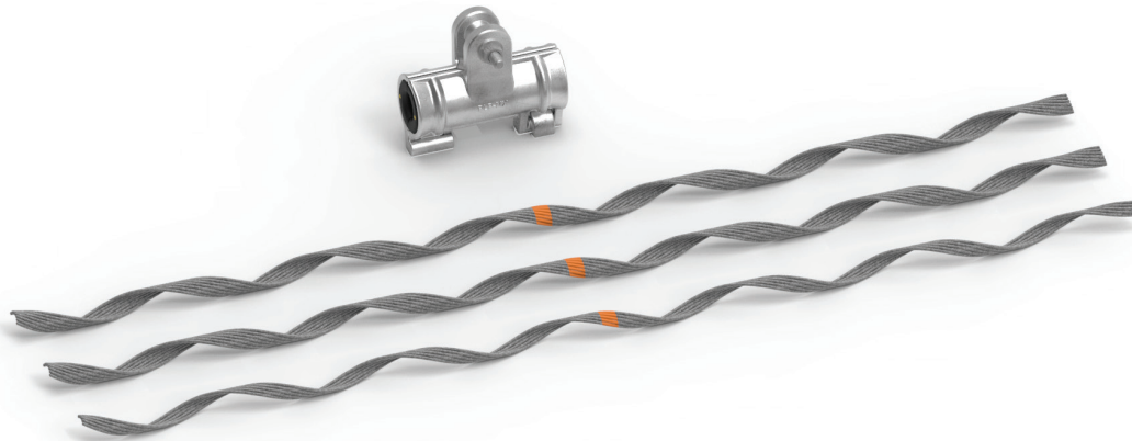
FIBERLIGN Aluminum Suspension for Cushion Inserts with SRR*

* Includes one complete insert (comprised of two Insert Halves)