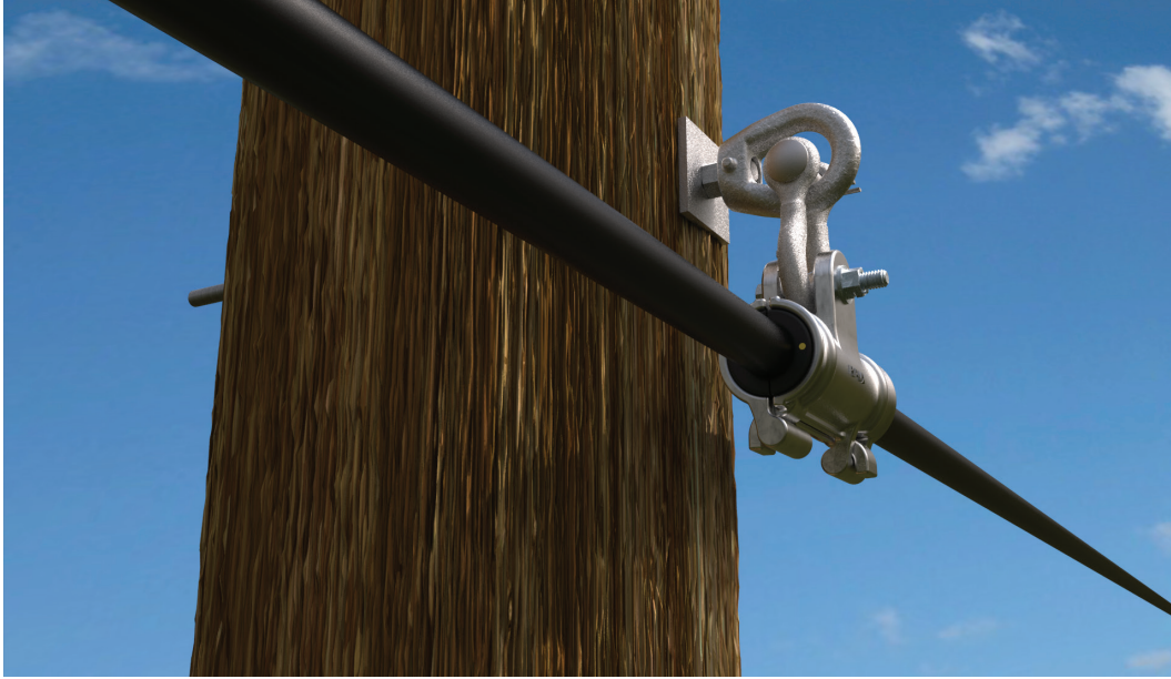
FASN Attached to Pole with 5/8" Double-Arming Bolt