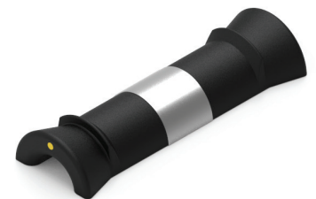
FIBERLIGN Aluminum Suspension Cushion Insert Half with Grit & Foil Tape