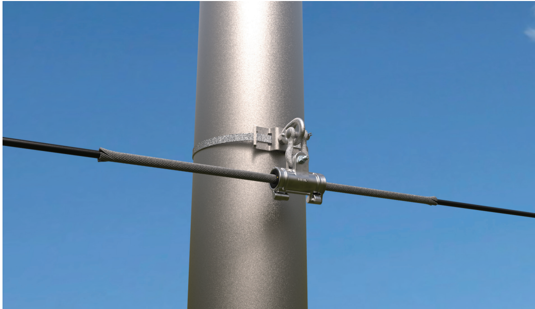
FASN with SRR