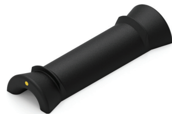
FIBERLIGN Aluminum Suspension Cushion Insert Half