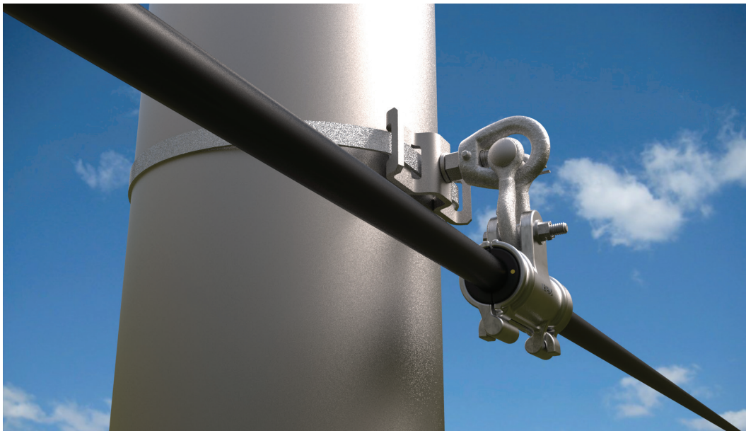
FASN Attached to Pole with Banding Bracket Kit