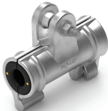
FIBERLIGN Aluminum Suspension* *Includes one complete insert (comprised of two Insert Halves)

For sizes greater than 1.050", contact PLP about the Legacy FAS