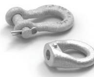
Anchor Shackle & 5/8"-11 Eye Nut